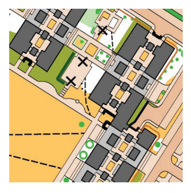
Sample of Arena map