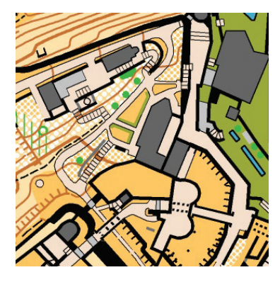
Sample of Kalemegdan map