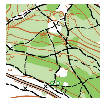
Sample of Košutnjak map